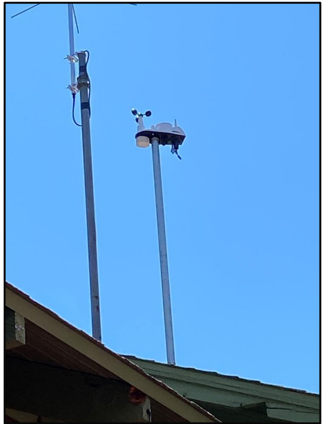
Weather Station at District Administration Office