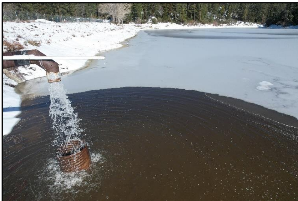
Strawberry Creek Water Inlet to Foster