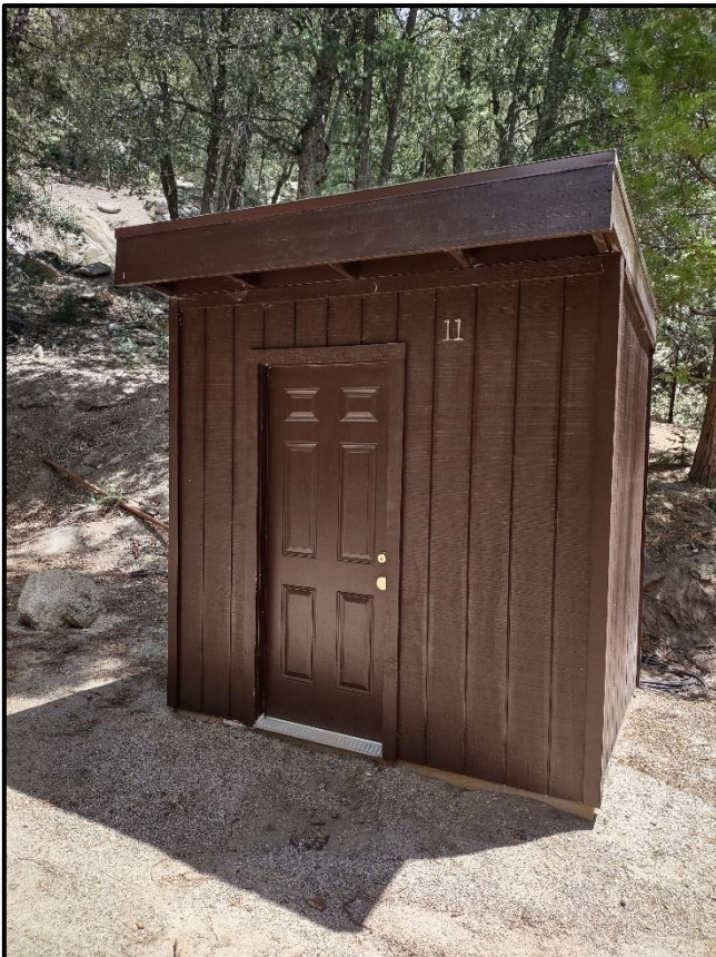
Well 11 House