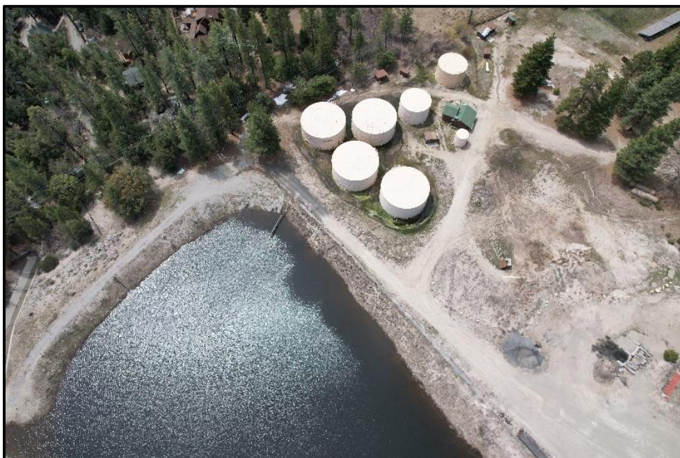
Foster Lake and Water Treatment