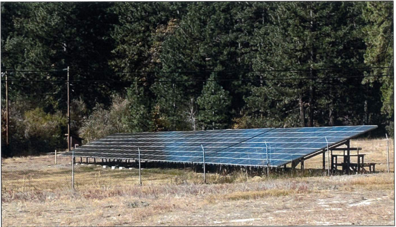
Solar Panel at Water Treatment Facility reduces District energy costs.

District crews are resolute employees and repair leaks throughout the year.