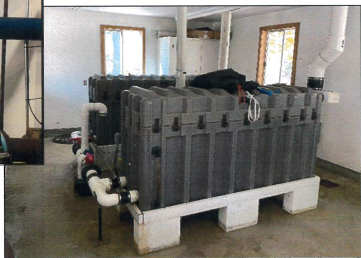
Aeration process for raw water prior to treatment.