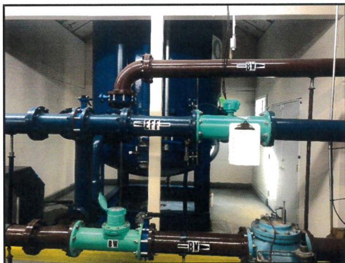
Water Treatment Facility piping.